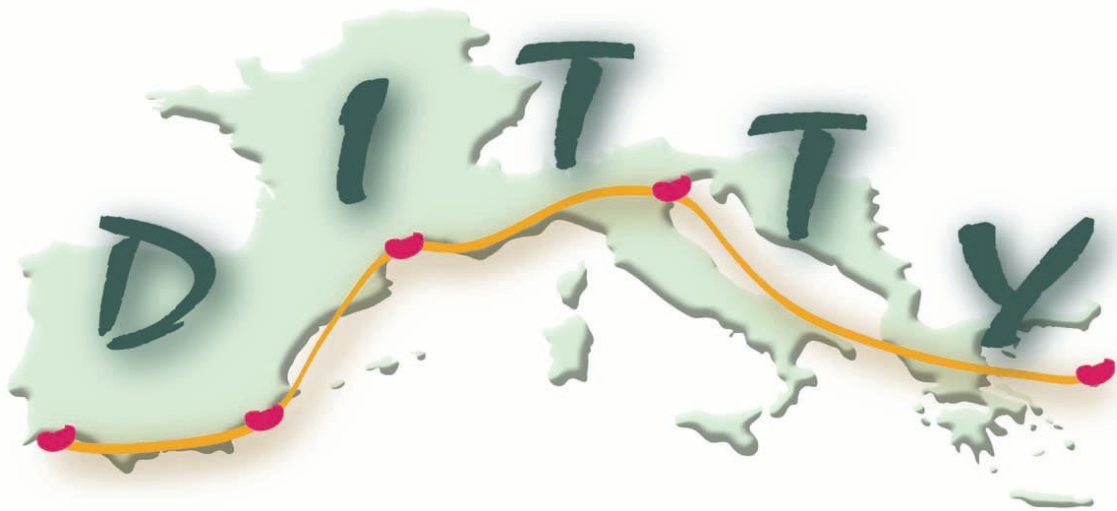
Figure 1. Map of the Southern Mediterranean Arc with the location of sites considered in the DITTY project.

Notten et al. (2003). Our scenarios are normative rather than descriptive as they draw