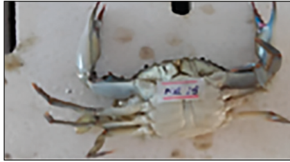
Fig. 3- The smallest individual.