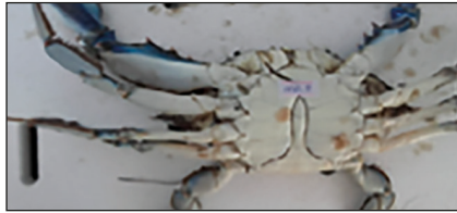
Fig. 4- The largest individual.