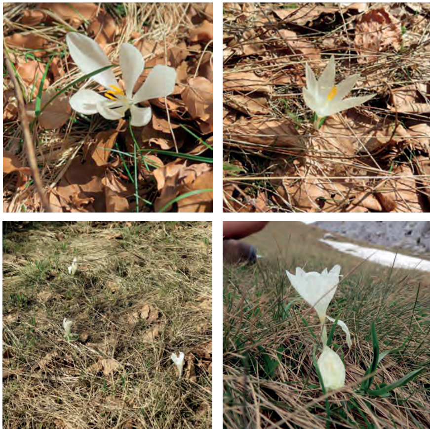
Figure 8. Crocus jablanicensis .

RANDELOVIC et al. (2012). They have found it on Jablanica Mt. in the western part of Macedonia. It has white style, stigma and perianth throat. This taxon is not in Albanian Flora.