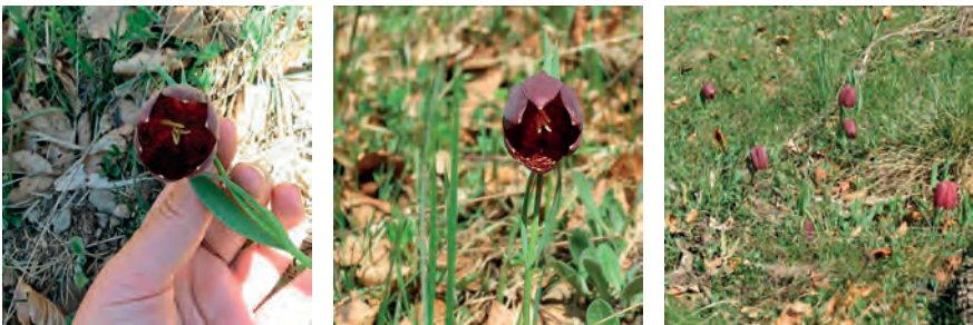
Figure 3. Fritillaria macedonica .

Fritillaria macedonica Bornm. (Fig. 3) is recorded on May 2017, in limestone grasslands of Strator and Vishorica, during a field trip at 1600 m a. s. l., coordinates 41°17'23.16" N, 20°28'26.69" E. The population that we found has 40 individuals. It is a perennial herbaceous plant; with stems 4-7 cm high; opposite lower leaves and upper group in three; lilac perianth; life form – geophytes; flowering time April – June. It is a range restricted species and according to TOMOVIĆ et al. (2007) it was described from Jabllanica Mt. ( locus classicus ) with distribution in central and eastern Albania (Gurabardhë, Jabllanicë, Mali me Gropa, Gollobordë, Klenjë and Mali i Zebës), in SW Macedonia and in SW Serbia in the Metohija region. In the Albanian Vascular Plants Red List 2013 is under the status LRnt.