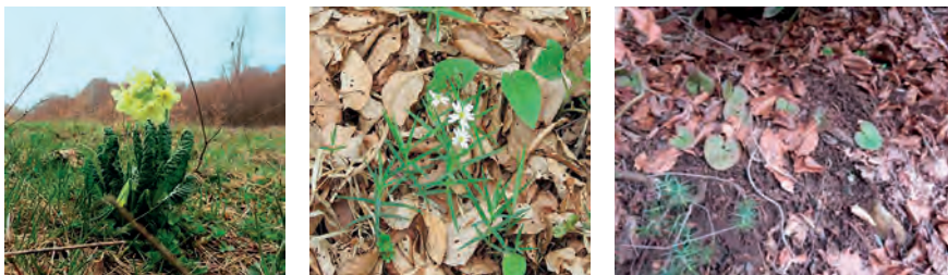
Figure 6. Primula elatior (A), Stellaria graminea (B), Asarum europaeum (C).

Stellaria holostea L. (Fig. 6 B) (syn. Cerastium holosteam Crantz.) is found on May 2016, 2017 in Ryen near the pathway in beech forest, calcareous mother rock, altitude 1300 m a.s.l. and coordinates 41° 7' 37.08"N 20°35' 8.49"E. Its population has 10 individuals. Perennial herbaceous plant; 60 cm height; rhizomatous; branching stems, four angled; inflorescence with several flowers with five white petals, bifid to about half way; opposite lanceolate leaves; life form – chamaephytes; flowering time April – June. It has a wide distribution: Albania, Belgium, Germany, Slovakia, Greece, Portugal, Turkey, France, etc. Its presence in Albania was reported and confirmed in RAKAJ et al. (2013).