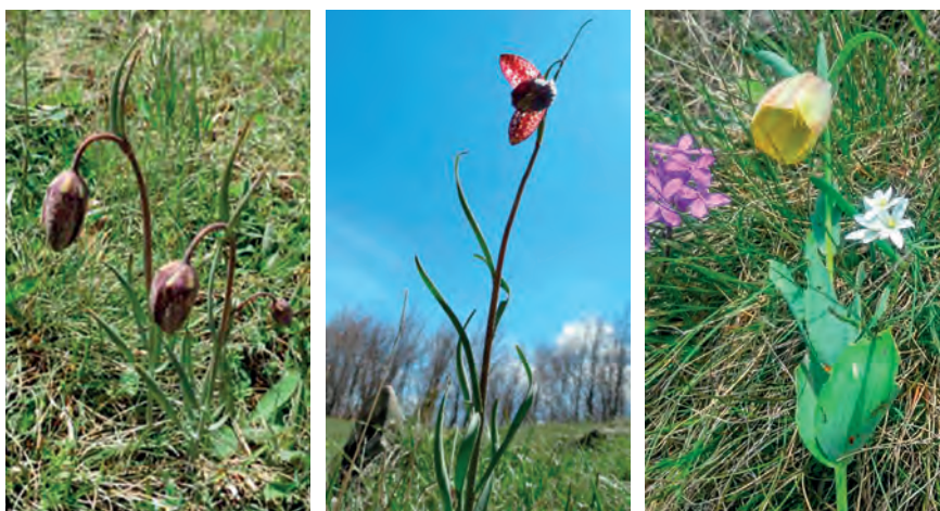
Figura 4. Fritillaria orientalis (A, B), Fritillaria graeca (C).

cm; linear opposite leaves; flowers purple outside with dark red spot hanging on the top of the stem; life form – geophytes; grows in dry grassy places, grasslands, on limestone; flowering time April – May; distribution: southeast Europe, Austria, Bulgaria, France, Caucasus, Greece, Turkey. The nomenclature of this taxon is in questions and unresolved. In The EuroMed PlantBase F. orientalis between other sources is given as accepted name is also given as synonym of Fritillaria montana Koch. In TOMOVIĆ et al. (2007) are described the differences between F. orientalis Adams named since 1805, 1808 and F. montana named from Italy since 1832. F. montana is present in IUCN Red List with DD status.