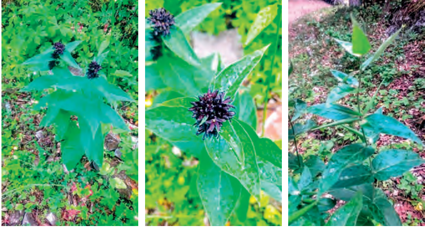
Figure 2. Vincetoxicum speciosum .

Fritillaria macedonica Bornm. (Fig. 3) is recorded on May 2017, in limestone grasslands of Strator and Vishorica, during a field trip at 1600 m a. s. l., coordinates 41°17'23.16" N, 20°28'26.69" E. The population that we found has 40 individuals. It is a perennial herbaceous plant; with stems 4-7 cm high; opposite lower leaves and upper group in three; lilac perianth; life form – geophytes; flowering time April – June. It is a range restricted species and according to TOMOVIĆ et al. (2007) it was described from Jabllanica Mt. ( locus classicus ) with distribution in central and eastern Albania (Gurabardhë, Jabllanicë, Mali me Gropa, Gollobordë, Klenjë and Mali i Zebës), in SW Macedonia and in SW Serbia in the Metohija region. In the Albanian Vascular Plants Red List 2013 is under the status LRnt.