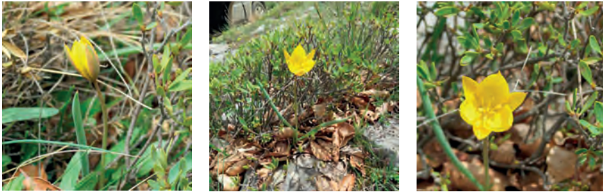
Figure 5. Tulipa sylvestris L.

Primula elatior (L.) Hill (Fig. 6 A) (syn. P. veris var. elatior L., P. elatior (L.) Hill etc.) is present in Dragan, Strap, Vishoricë, in open limestone areas of Fagus sylvatica forest often mixed with Abies alba , over 1550 m a.s.l. and coordinates 41°16'56.25"N 20°27'28.44"E. It is evidenced on May 2017 in a field trip for searching this taxon, which often is confused with P. veris or Primula x polyantha (hybrid of P. vulgaris x P. veris ). The population has 80 individuals. Perennial herbaceous plant, soft-yellow flowers, crestfallen in one side of the stem; bright green leaves in upgrounded rosettes 20 cm height; life form – hemicryptophytes; flowering time March – June. It has a wide range of distribution as native to Europe and in others as introduced: Albania, Austria, Bulgaria, Greece, Spain, Italy, Norway, Finland, etc.