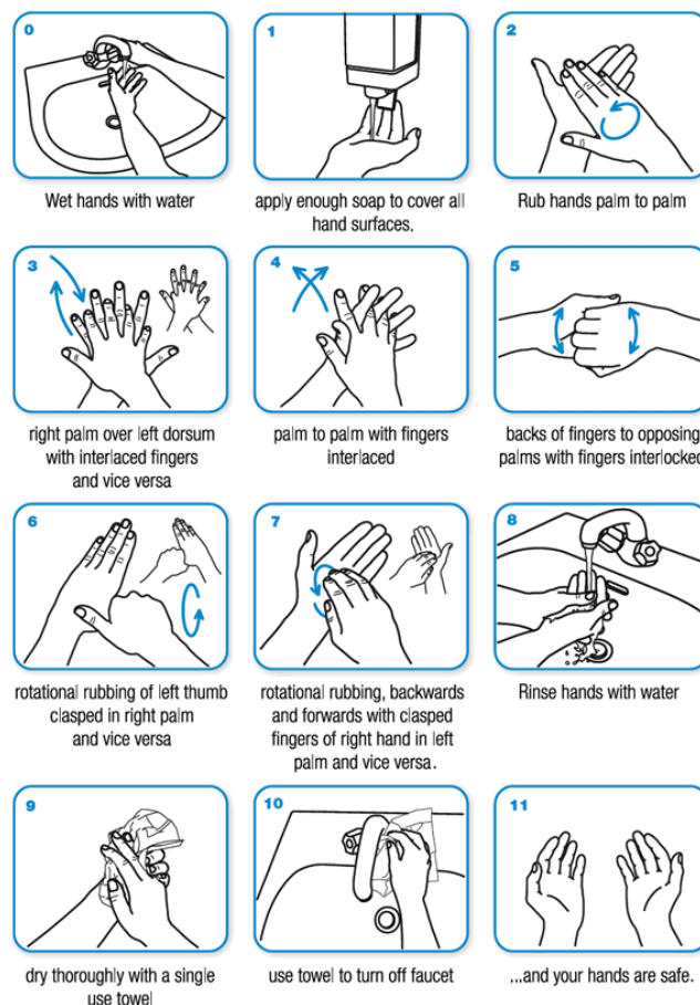
Figure 1 How do I wash my hands properly?

The contemporary reference being the pandemic, the fixed visual content provided by the World Health Organization of the washing hands guide is an image composed of twelve boxes, numbered from 0 to 11, that shows a detailed sequence of actions to be performed in order to obtain an effective, hopefully virus free cleanliness. The image (Figure 1) is to be found on the website of the WHO, with the further indication that “Washing your hands properly takes about as long as singing ‘Happy Birthday’ twice” (World Health Organization).