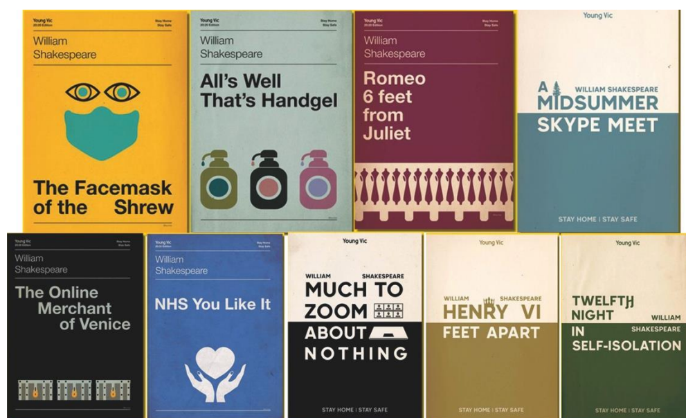
Figure 6 Young Vic's Socially distanced Shakespeare.

From the same profile, a series of ironic elaborations of contemporary 'Shakespearean' plays was published: