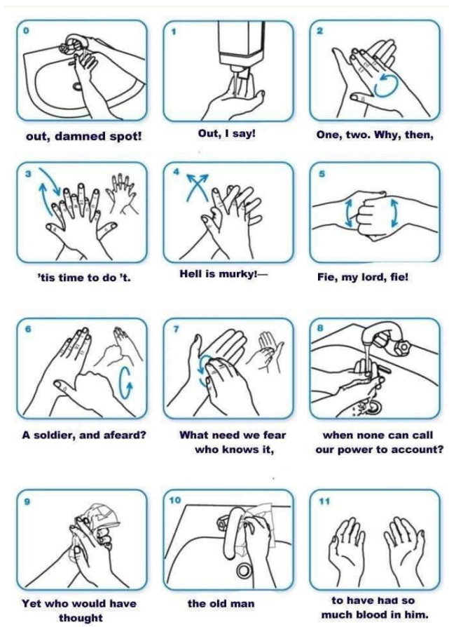
Figure 2 Lady Macbeth's washing hands internet meme.