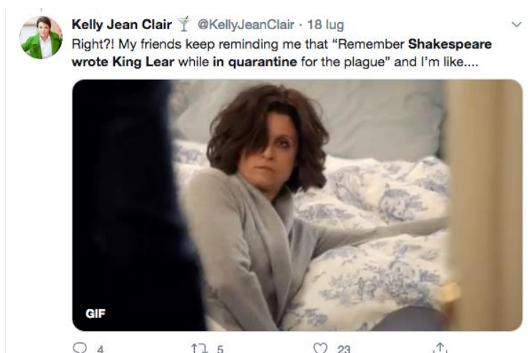
Figure 3 A Shakespearean textual and visual content.