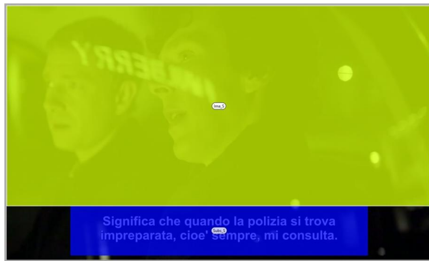
Figure 1 Areas of Interest: image and subtitle areas.

Participants' eye movements were recorded using a Tobii T60 eye tracker (Tobii Technology, AB, Stockholm, Sweden). This remote eye tracker is integrated in a 17-inch TFT monitor with a 1024×768 resolution. Stimuli are presented directly on the monitor. The video resolution was adapted so the image would fit the whole screen. The eye-tracking system is unobtrusive and allows for a large degree of head movement, ensuring natural behaviour and ecologically valid results. It has a sampling rate of 60 Hz. During the recording time, the Tobii T60 eye tracker collects raw gaze data every 16.6 ms. Using a filter, the coordinates of the movements recorded by the eye tracker are parsed into fixations and saccades. We used the Tobii I-VT fixation filter to process the raw data obtained from the eye tracker. As in most eye-tracking studies, for the subtitle condition, we divided the screen into two areas of interest (AOIs) (Kruger et al. 2015), namely the subtitle area at the bottom of the screen, and the image area (Figure 1).